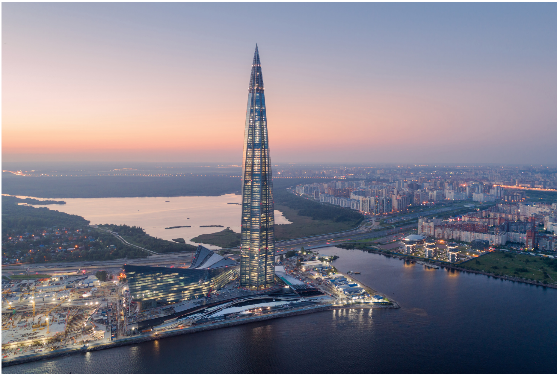
RUSSIA SAINT PETERSBURG, LAKHTA CENTRE - ENERGY 72/38, IPASOL BRIGHT WHITE ON CLEARVISION AND PLANIBEL LINEA AZZURRA - TONY KETTLE AND GORPROJECT CJCS - LEED PLATINUM