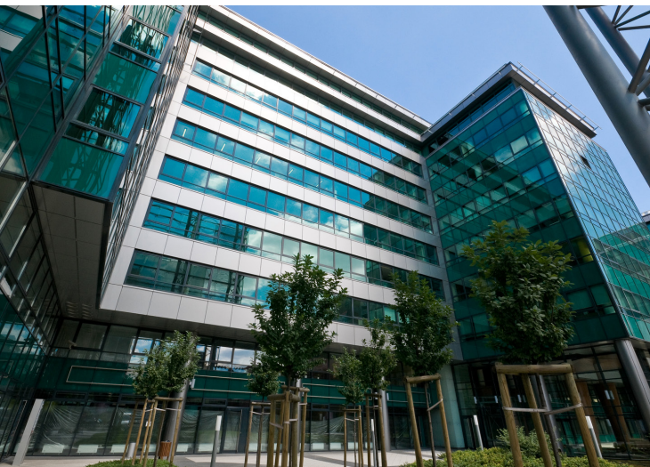
HUNGARY BUDAPEST, VÁCI 33 - STOPRAY VISION-61T - LEED SILVER